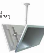
TH-3070-CTW Pole + Single display