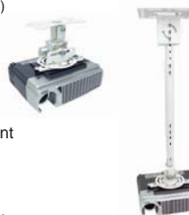
TH-WH-PJ-FM Flush mount