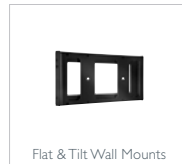
Flat & Tilt Wall Mounts