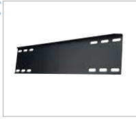
Metal Stud Wall Plate for SP740 (pg. 6)