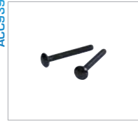
2.25" Carriage Bolts for thicker desktop surfaces (pg. 3)