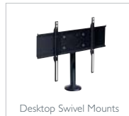
Desktop Swivel Mounts