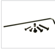
Security Fasteners for SP740P and SA740P Wall Arms (pg. 6 and 7)