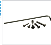
Security Fasteners for SA745PU, SA750PU and SA760PU Wall Arms (pg. 7)