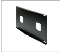
Metal Stud Wall Plate for SA740 (pg. 7)