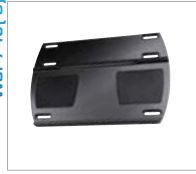
Metal Stud Wall Plate for SA745 (pg. 7)