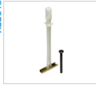
Metal Stud Fastener Kit - 6 togglers