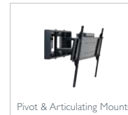
Pivot & Articulating Mounts